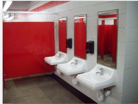
View of the Lavatories