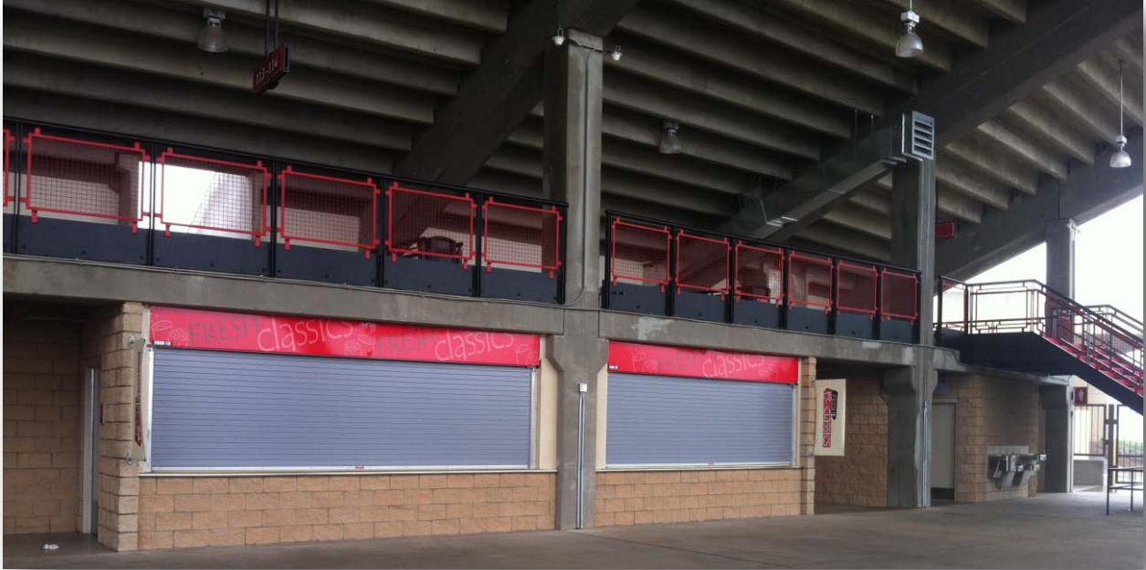
Exterior View of the Concession Stands

Scope: This project constructed 7,000 GSF Build-Out under the seating stands including toilets and concessions. Project provided an additional 24 WCs for women and 21 plumbing fixtures for men; 6 lavatories for women and 5 for men. Project also included concessions infrastructure and build out by Ovations.