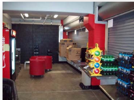
View within the Concession