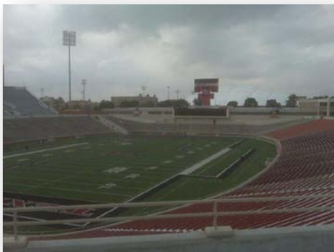
View of the Stadium