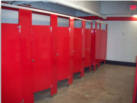
View of the Toilet Stalls