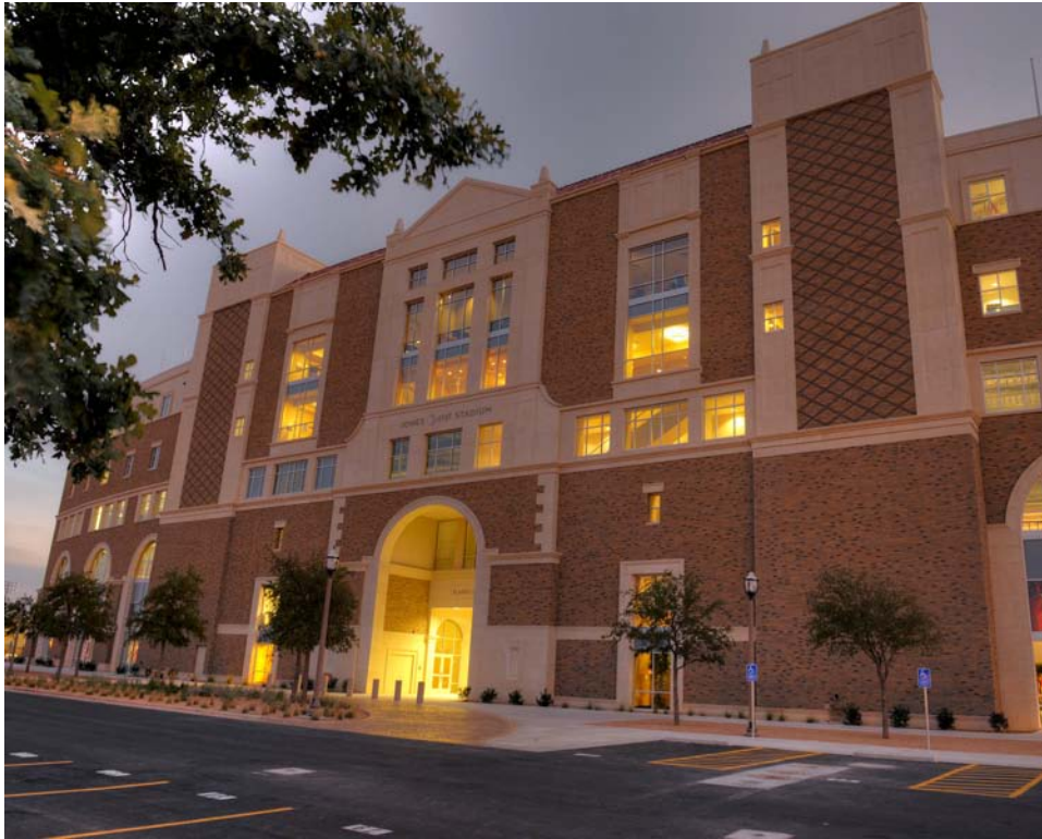
View of the East Stadium Building

Project Description: This project constructed a five-story building with 26 suites and 540 club seats and space on the ground level for the future Athletics Ticket Office, Red Raider Club and Hall of Fame. The building has Spanish Renaissance architecture to complement the west stadium building. A retail store is located in the north end of the first floor and a private club occupies the 4 th floor with kitchens located on the mezzanine level and the 4 th floor. The project also included related site and utility infrastructure work, landscape enhancements and public art.