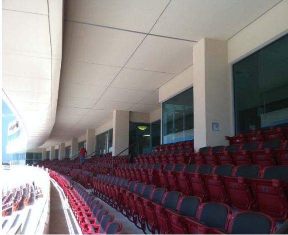
View of Club Seating