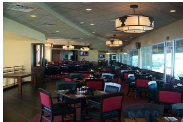
View of Texas Tech Club Dining Room