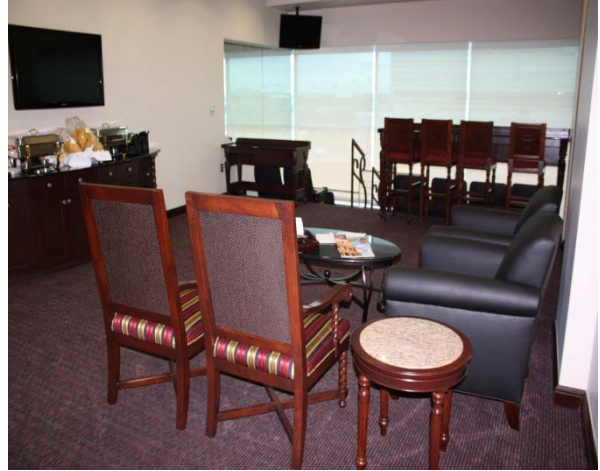
View of Typical 5 th Level Suite