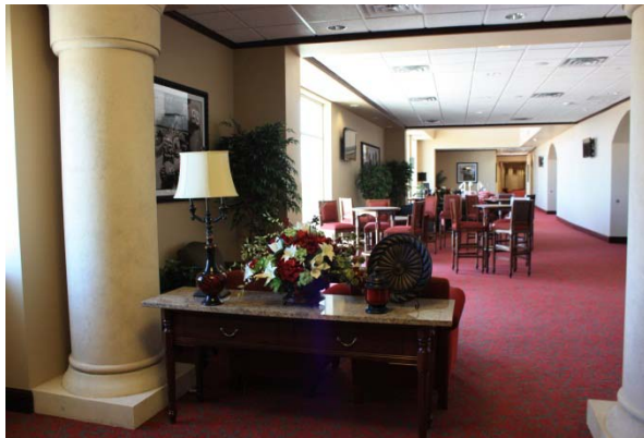
View of the common area on Suite Level